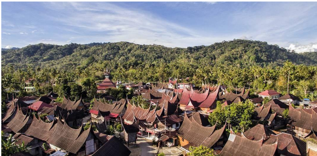
Picture 2. Seribu Rumah Gadang Village